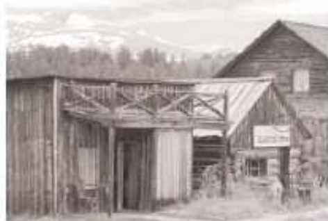
The Diorama building is located beside the Blacksmith shop and Old Garo School house.

accident that left him paralyzed from the chest down. Since his arms were weak he needed a hammer and chisel to perform his love for carving 3 dimensional miniature art, depicting the Colorado mining history in his elaborate life-like dioramas. His work was shown in the Colorado School of Mines, in Empire and eleven of his dioramas have made their way to South Park City.- Enjoy the exhibit!