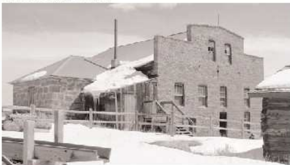
SOUTH PARK CITY P.O. BOX 634 FAIRPLAY, CO 80440

Currently there are 43 buildings and structures and over 60,000 artifacts that portray the economic and social aspects of an 1860s to 1890s mining town. Refurbishing of the historic structures is ongoing and a mining exhibit addition was just finished last year.