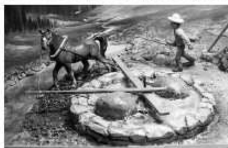
The photographs show the detailed sculptures inside the dioramas, depicting the hard lives of Colorado miners in the mid and late 1800s.